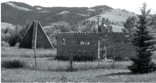
Archie Bray Brickyard

Please join me on our museum trip to cool Montana for "Clay in the Big Sky," June 20-25, 2006. Travelers will have privileged access to the world acclaimed Archie Bray Foundation for the Ceramic Arts and many of the Bray alumni active in the area. The Bray is hosting their Bray International 2006, a three-day extravaganza including lectures, demonstrations, studio and collection visits, culminating in a gala dinner and auction. Founded in 1951, the Bray is a non-profit, educational institution dedicated to the enrichment of the ceramic arts, offering residencies and specialized workshops to ceramic artists from around the world.